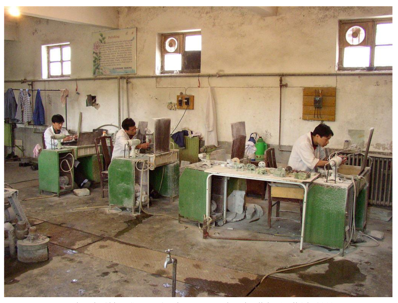
Factory workers in China. April 9th, 2010.